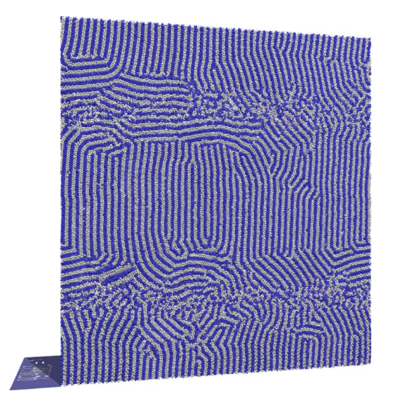
FIG. 1. Shear-banded state of a large system of amphiphilic molecules modeled as 995328 A-B dimers with attractive A-A and B-B interactions. The particle color is used to distinguish between A and B. Direction of view is the x direction, i.e., the direction of the shear velocity. Direction up-down is the y direction, i.e., the direction of the shear gradient. The system organizes in lamellas whose normal is oriented in z direction. The driving occurs at narrow layers at (i) the top/bottom and (ii) the center of the box. Near these layers, the velocity gradient is essentially zero, and the molecules move as a homogeneous "block." The shear gradient is concentrated in small regions located in the middle between the driving layers; in these regions the system is disordered.

The simulations were carried out with a system consisting of 4096 Lennard-Jones (LJ) particles at a density of \rho